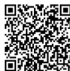
EXHIBIT AT KEY